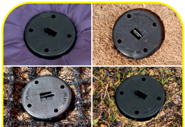
S2 Zip Anchor - a more reliable solution for weed control, ground cover and grass reinforcement.

PDEA®, ARGS® and ARVS® are Registered Trademarks of Platipus Anchors.