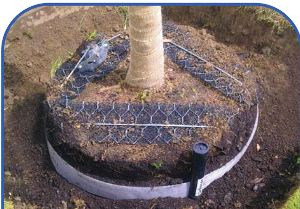
Innovative system that delivers water and air evenly around the rootball directly targeting the root zone.