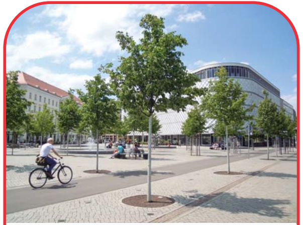
Ideal for securing trees in shallow soil, on roof gardens or planting areas restricted by buried services.