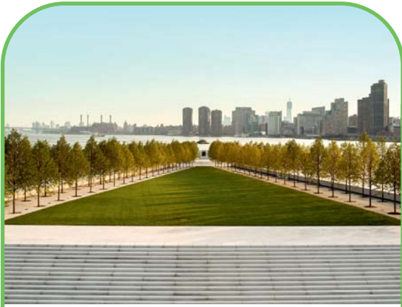
The most popular method for supporting rootballed, airpot and container grown trees up to 12m in height.